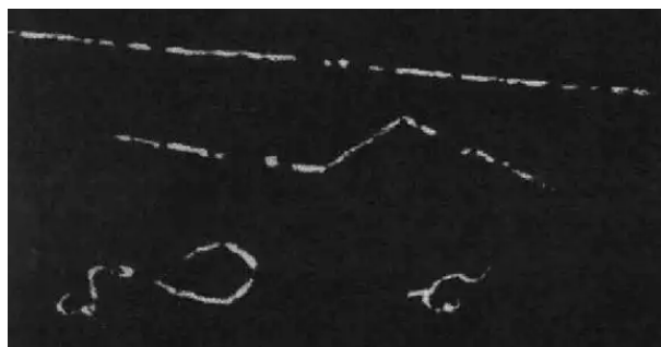
Fig. 2: Thin trails mostly derive from beta rays (electrons).