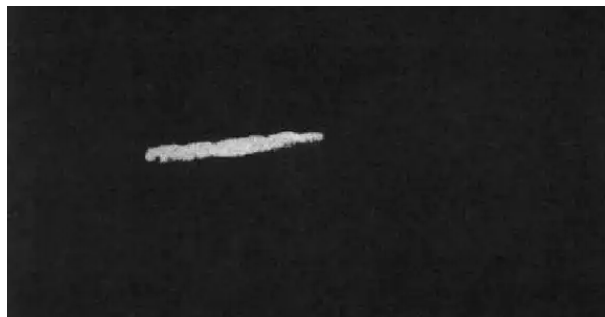
Fig. 1: Alpha particles (helium nuclei) show short and thick trails.

All electrically-charged particles can be detected in the chamber: alpha particles, protons, muons, electrons and positrons. On the basis of the different trail shapes you can even distinguish them.