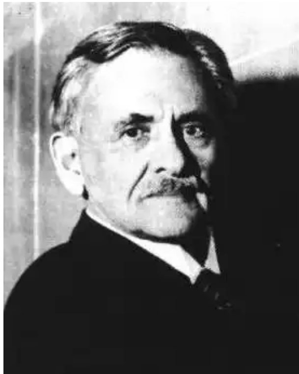
Fig. 1: Albert Abraham Michelson (1852-1931).