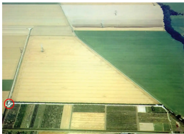
Fig. 3: GEO 600 near Hannover from a bird's eye view. Clearly visible: the two 600 m long arms for the partial beams of the interferometer. The rest of the interferometer, the laser and the measuring station, is inside the red-rimmed building.

The scientists had to wait for a long time, but on the 14th of September 2015, the time had finally come: With both LIGO interferometers, a gravitational wave was detected for the first time! 1.3 billion light-years away, two black holes of 29 and 36 solar masses had collided, emitting very strong gravitational waves. Prior to this, they had been orbiting each other in a binary star system. It was very important that the signal was measured at both of LIGO's interferometers, allowing scientists to rule out disturbances from other vibrations in the nearby environment. With the first detection of a gravitational wave, the scientists were able to prove Einstein's theory of space-time. For this, Rainer Weiss, Barry Barish and Kip Thorne received the Nobel Prize in Physics in 2017.