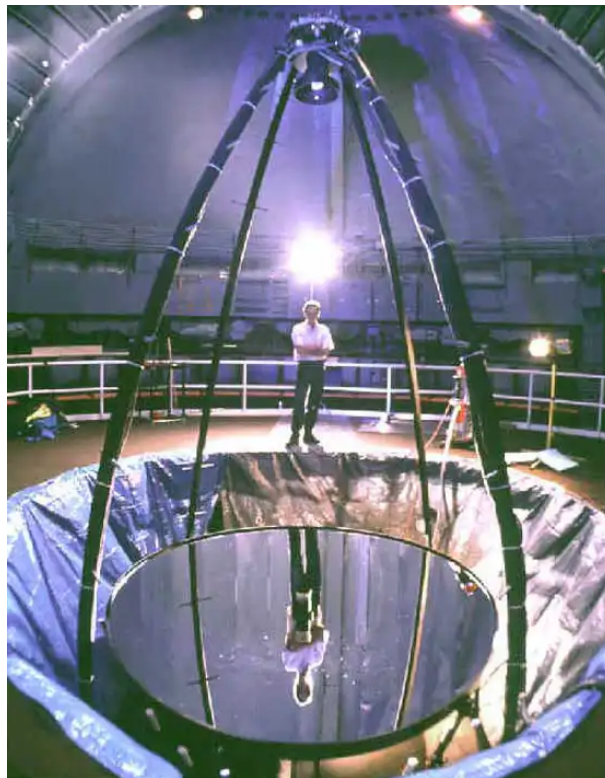
Fig. 1: Liquid-mirror telescope at NASA Orbital Debris Laboratory.

Astronomers use liquid parabolic mirrors made of mercury, because they are perfectly smooth and thus give brilliant pictures from outer space. Car headlights and torches also contain paraboloidal reflectors to focus the light into a narrow, bright beam.