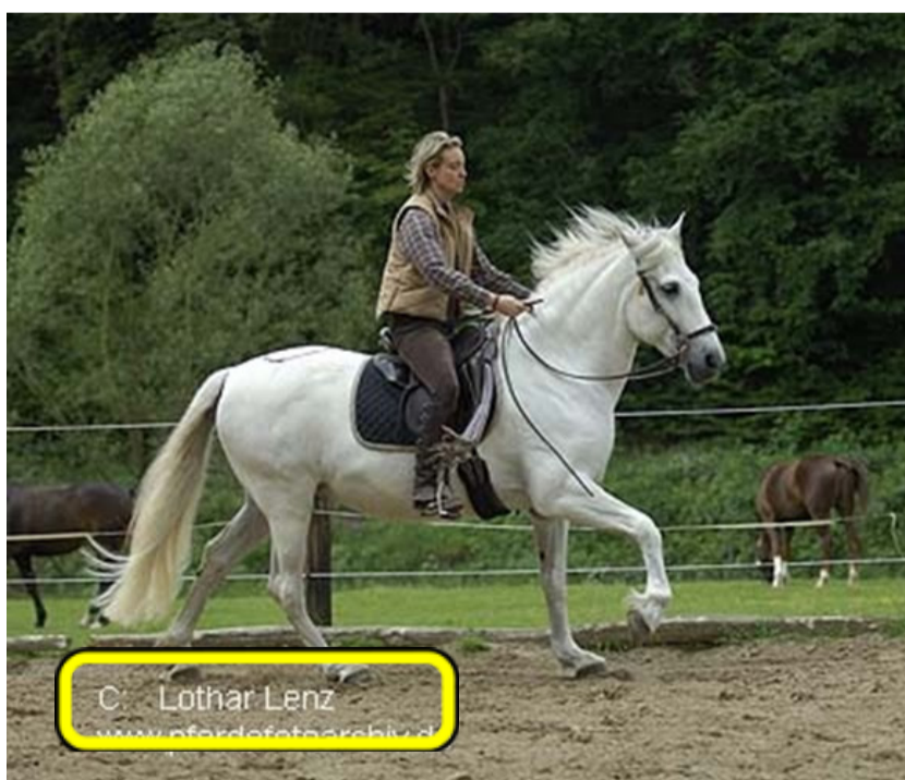
Fig. 1: Original horse image (Sebastian Lapuschkin, Fraunhofer Heinrich Hertz Institute).

This method already revealed that an artificial intelligence has identified a horse based on the copyright information in an image, instead of the actual horse in it (see yellow mark in Fig. 1 and the red-coloured area in Fig. 2).