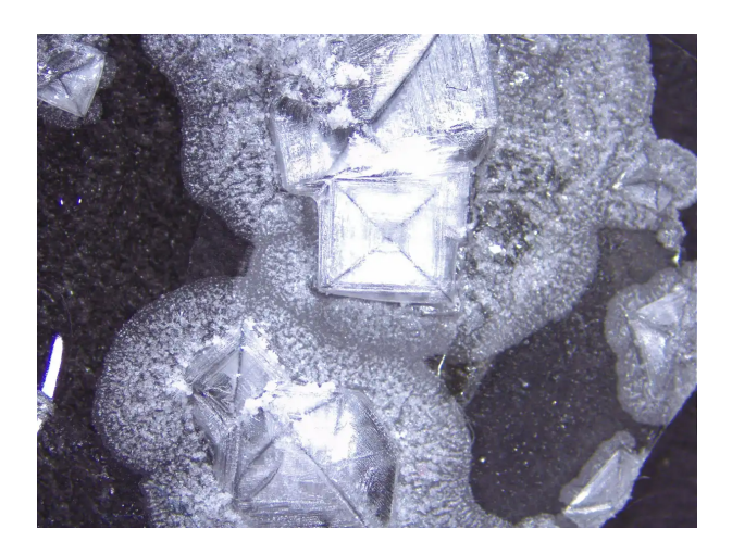
Fig. 1: salt crystals under the microscope.

At first sight, salt and sugar look similar: small white grains. But when you take a closer look, you can distinguish them not only by their taste, but also by their different crystal structure: Under the microscope salt looks pyramid-shaped with a square base (Fig. 1). Sugar crystals are more complex and have more edges and corners than salt crystals (Fig. 2).