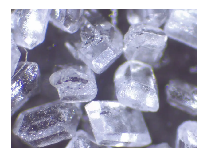
Fig. 2: sugar crystals under the microscope.

However, you can only partially see the angular-shaped structure in the table salt from the package. Most grains of salt appear roundish, as the corners rub against each other and wear out over time. The angular shape becomes more visible when the salt is first mixed with water and then the water evaporates again. The salt molecules dissolve in the water and when the water evaporates, they come together again and arrange themselves.